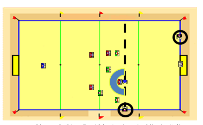
Diagram B: Direct Free Kick taken from the Offensive Half